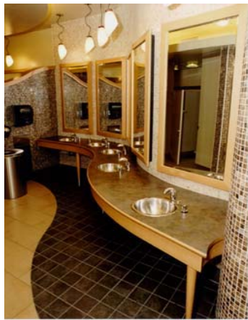
Oakridge Centre Washroom

The Architectural Woodwork Manufacturers Association of Canada was established in 1970. The main emphasis of AWMAC has always been to promote and improve quality standards while keeping pace with new products and technology in the architectural woodwork industry.